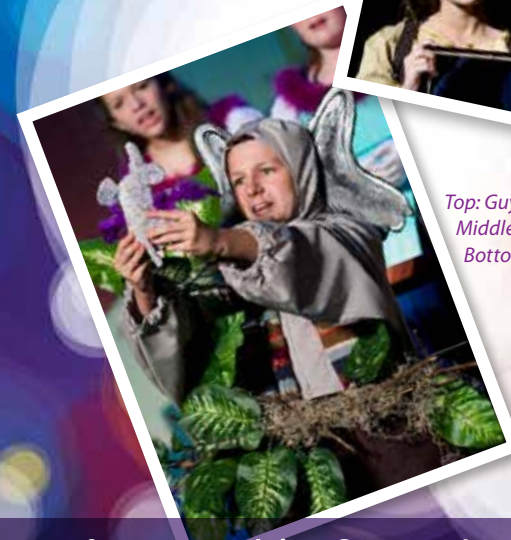
Top: Guys and Dolls Jr. Middle: Sweeney Todd Bottom: Seussical Jr.